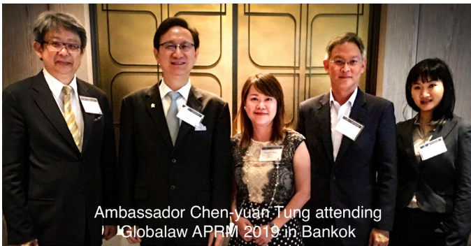
Ambassador Chen-yuan Tung attending Globalaw APRM 2019 in Bangkok