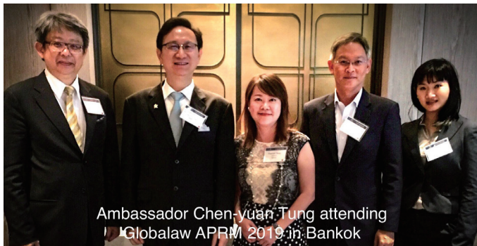
Ambassador Chen-yuan Tung attending Globalaw APRM 2019 in Bangkok