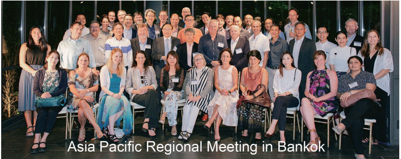
Asia Pacific Regional Meeting in Bangkok